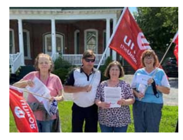
Shelter workers at the Lennox and Addington Interval House in Napanee ratified the employer's most recent offer, ending a fivementh strike.