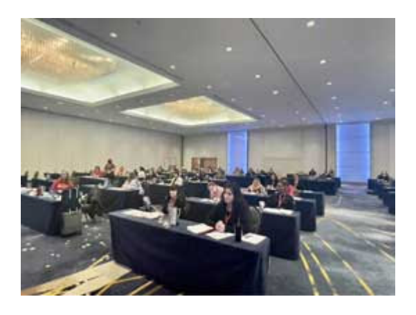
Long-term care workers meet in person for the first in two and half years and plan mobilization to impact Ontario election.