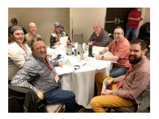
Close to 200 delegates gathered in Montreal for the Eastern Forestry Wage Caucus where members and leaders in the sector set bargaining priorities and selected Resolute Forest Products as the target employer.